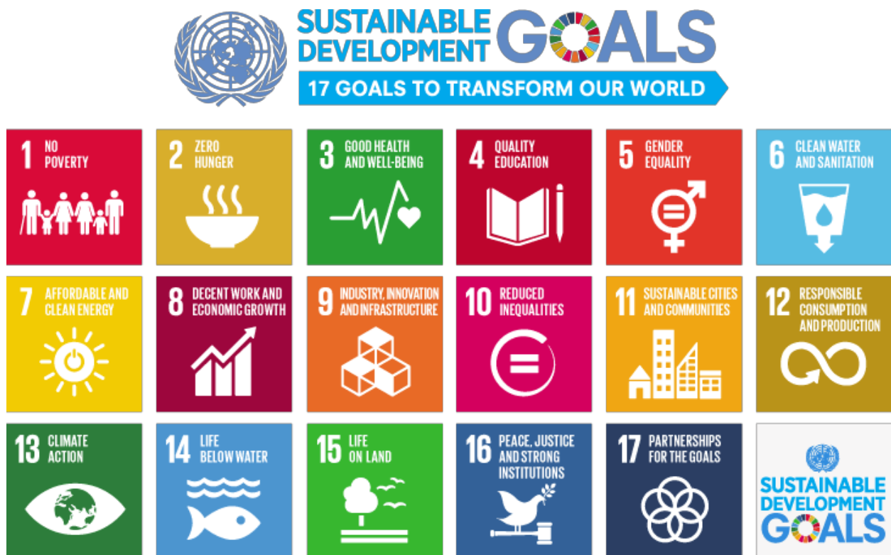
Figure 1 Illustration of the United Nations 17 Sustainable Development Goals of the Agenda 2030

At the United Nations, the principle framework for concerted action has since 2015 been the 2030 Agenda for Sustainable Development. This is a resolution adopted by the General Assembly of the United Nations on 25 September 2015. The Agenda includes 17 Sustainable Development Goals (SDGs) and 169 associated targets. The Agenda encompasses a number of central issues that are particularly relevant to the sustainable development and wellbeing of Aruba.